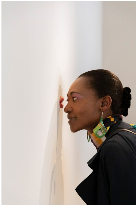
Mika Rottenberg, Lips (Study #3), 2016/19 © Mika Rottenberg, courtesy of the artist and Hauser & Wirth Installation view, Museum Tinguely, Basel, 2024