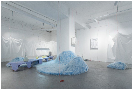
Fuzzy Earth, Warm Rain, 2024, exhibition view 1111 Galéria