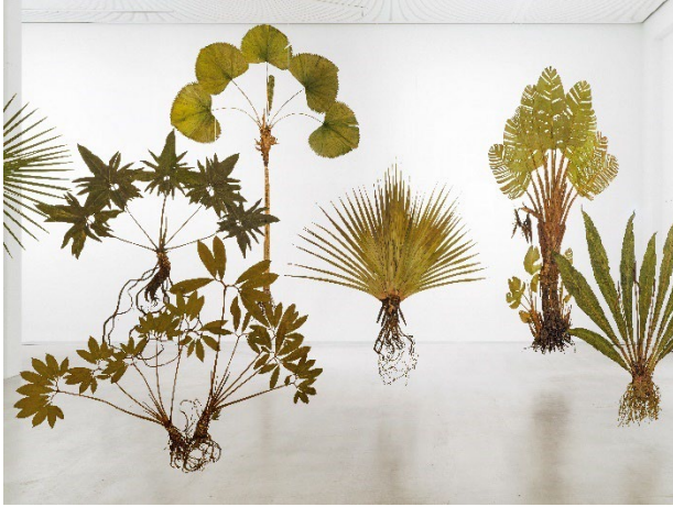
Julius von Bismarck, I like the flowers, 2017/2023, installation view When Platitudes Become Form, Berlinische Galerie, Berlin, 2023; courtesy of Julius von Bismarck, alexander levy, Berlin; Sies + Höke, Düsseldorf © Julius von Bismarck; VG Bild-Kunst, Bonn 2024, Photo: Roman März